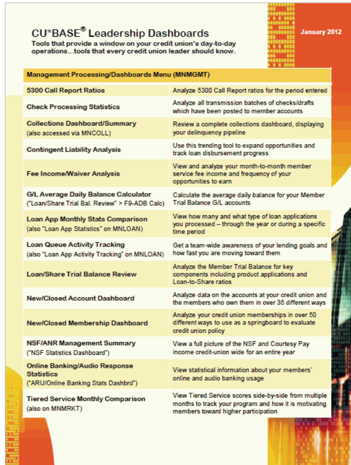
Check out the “Leadership Dashboards” publication or a complete listing of dashboards available in CU*BASE.

http://cuanswers.com/pdf/cb_ref/LeadershipDashboards.pdf